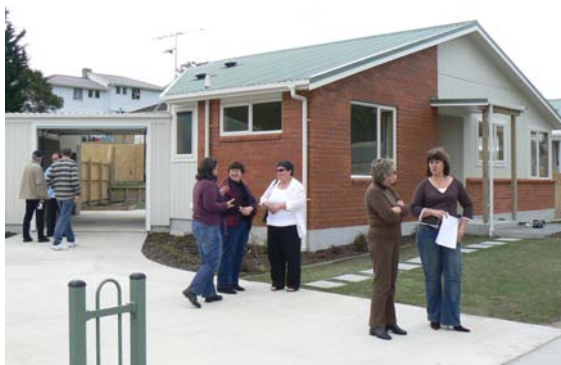
Board members visited a number of Housing New Zealand sites in Wellington, including this property in Porirua