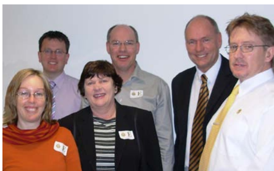
Members of the board meet with Hon Chris Carter, Minister for Housing (second from right)